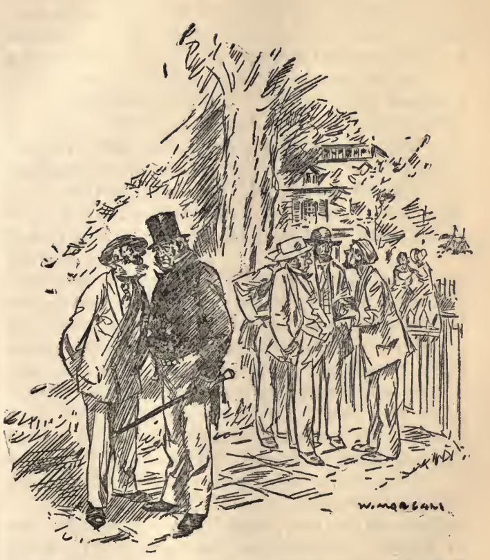
**He may be minister of the Regular church . . . but he'll never marry her, now."